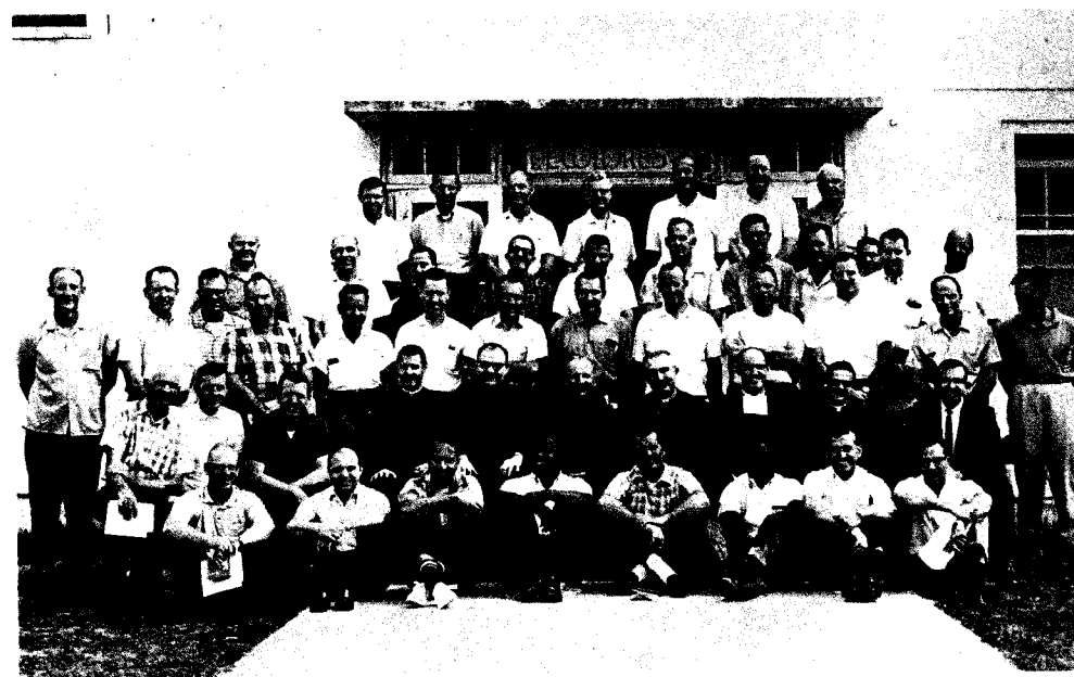
CURSO NO. TWO . . . MAY 5-8, 1966