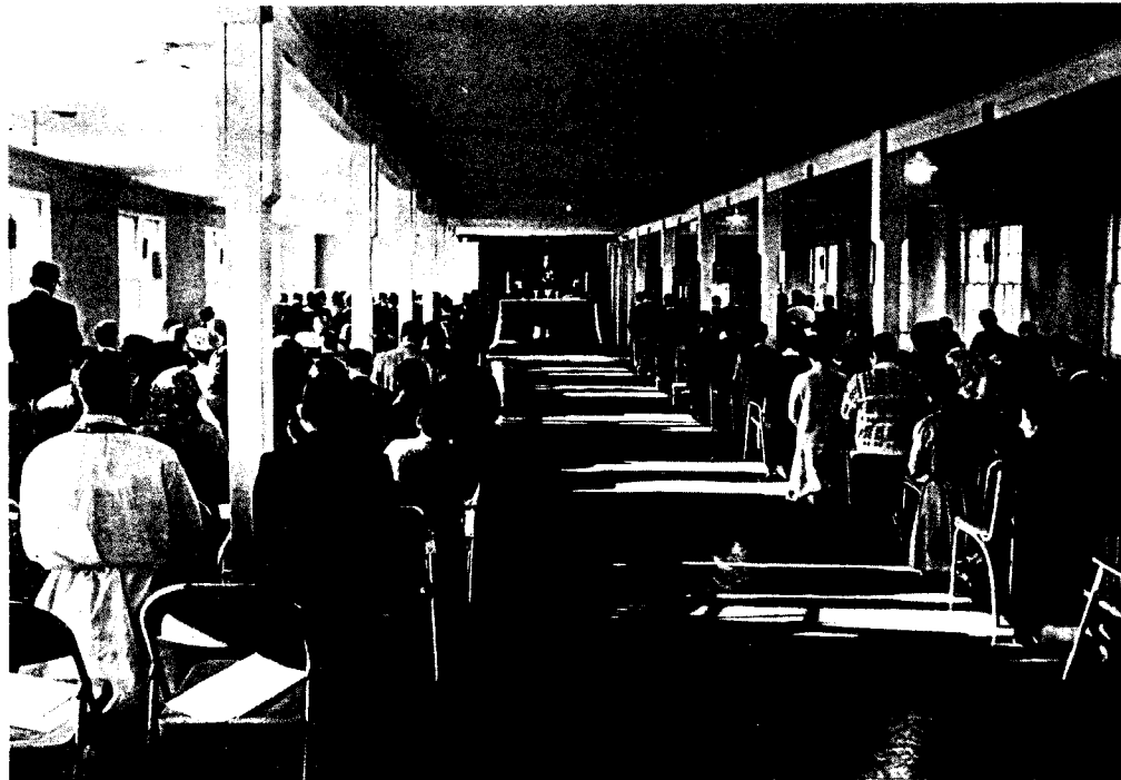
SUNDAY MASS IN THE BARRACKS