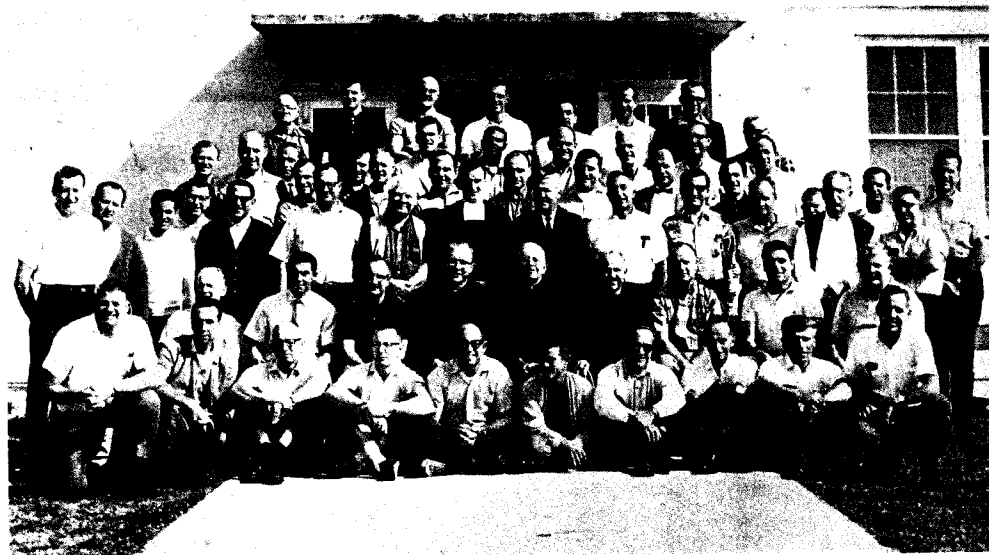
CURSO NO. ONE . . . MARCH 17-20, 1966